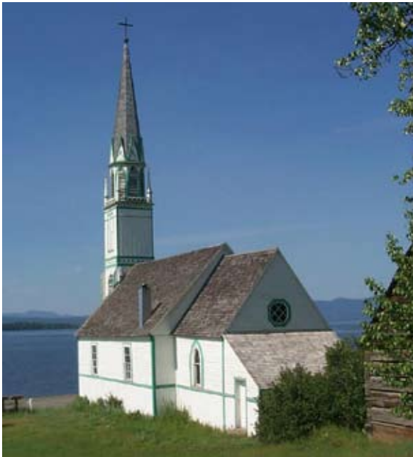
Our Lady of Good Hope Catholic Church on the shores of Stuart Lake in Fort St. James.

For information on the Coalition please contact